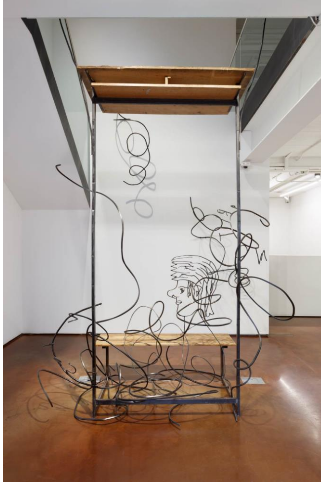
Installation view of A Shiver in Search of a Spine , ARARIO GALLERY, Seoul, 2019