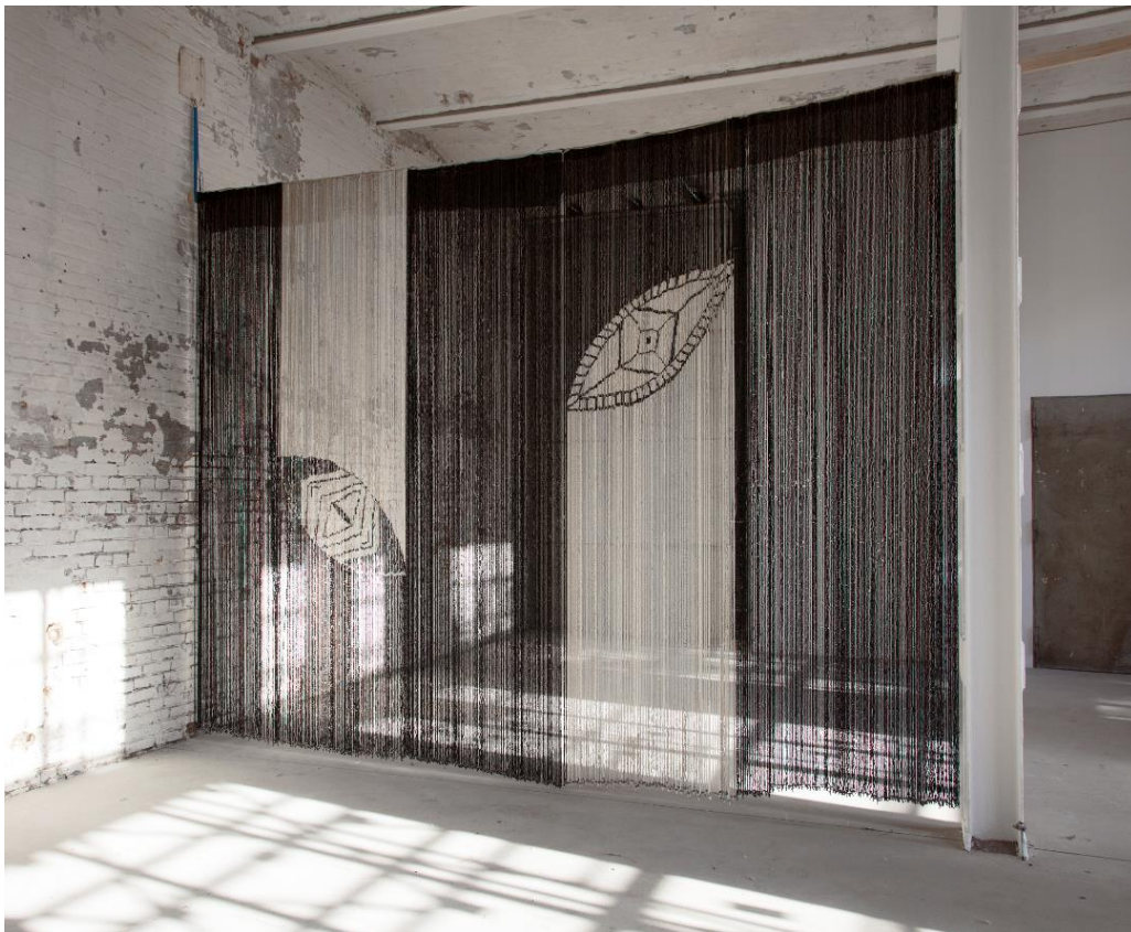
Zora Mann, Cosmophagy , 2015, Plastic beads, string, fabric, 350 x 460 ซม