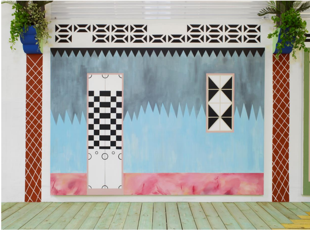
Sol Calero, La Escuela del Sur , 2015, Acrylic on canvas, 200 x 290 cm