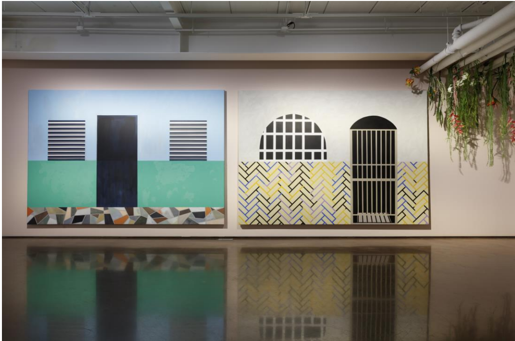
Installation view of A Shiver in Search of a Spine , ARARIO GALLERY, Seoul, 2019