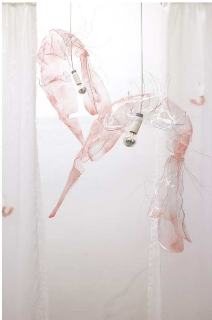
Kasia Fudakowski, The revenge (Panel 29) , 2019, steel, Plexi glass, fabric, polymer clay, acetate, electrical cable, electrical cable, light bulbs, paint, 200 x 172 x 30 cm ©The artist & ChertLüdde, Berlin