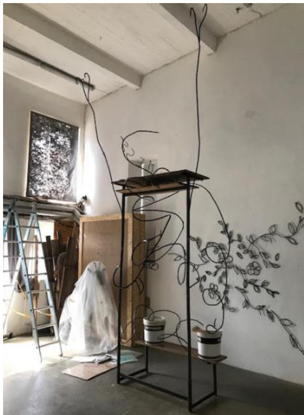
Petrit Halilaj, Abetare (Table) , 2019, Steel, wood, 440 x 250 x 180 cm