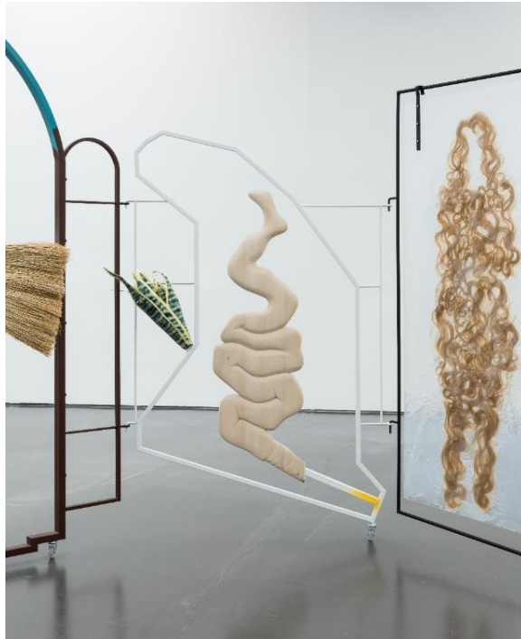
Kasia Fudakowski, The Bride Stripped Bare... (Panel 10) , 2017, Powder-coated steel, painted aluminium, Linden wood carved by Özkan Şener, 185 × 121 × 32 cm