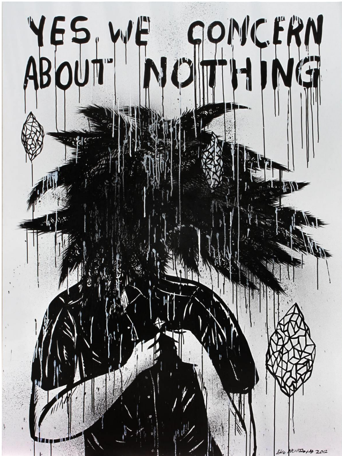
Yes, We Concern About Nothing

2012, Acrylic, ink, krink marker on canvas, 200x150cm