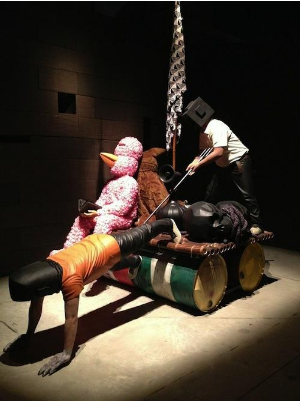
2013 Venice Biennale Indonesian Pavillion