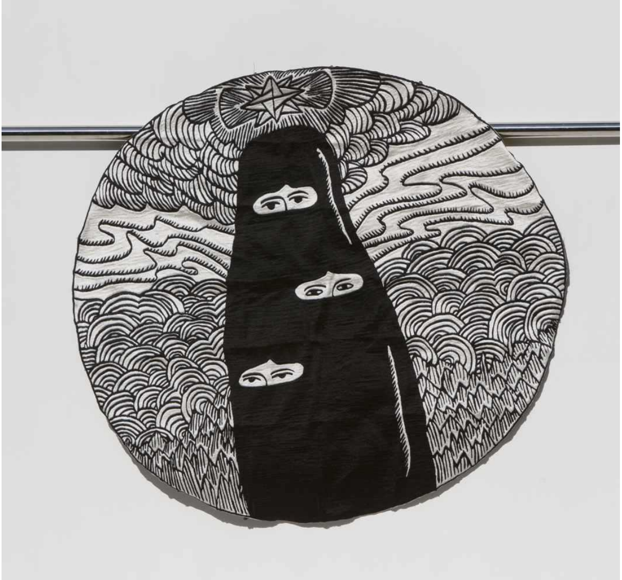
I Am A Fungus of My Own, 2013, 천 위에 레이온 실로 기계 자수, 71x77cm