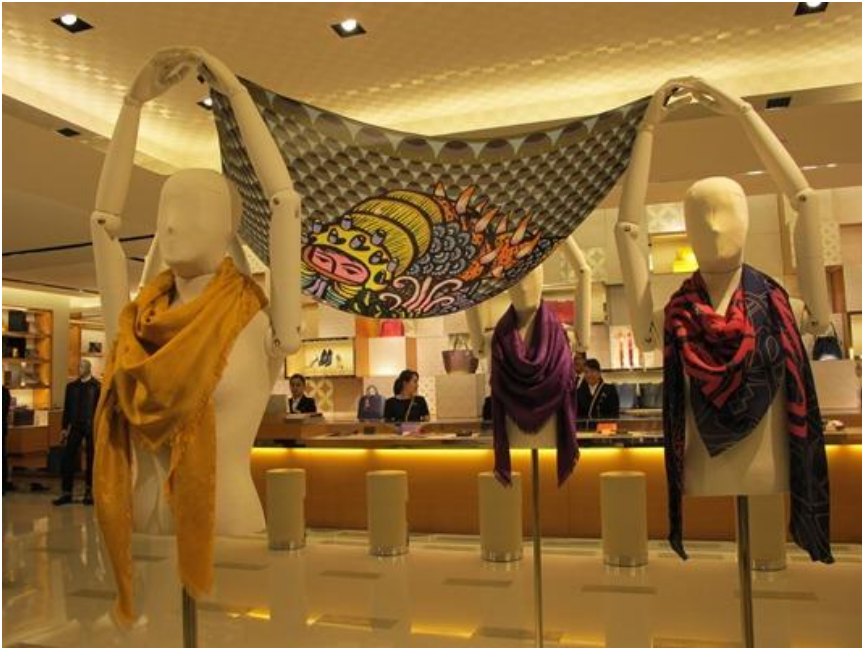
2013 Fall/Winter Scarf Collection