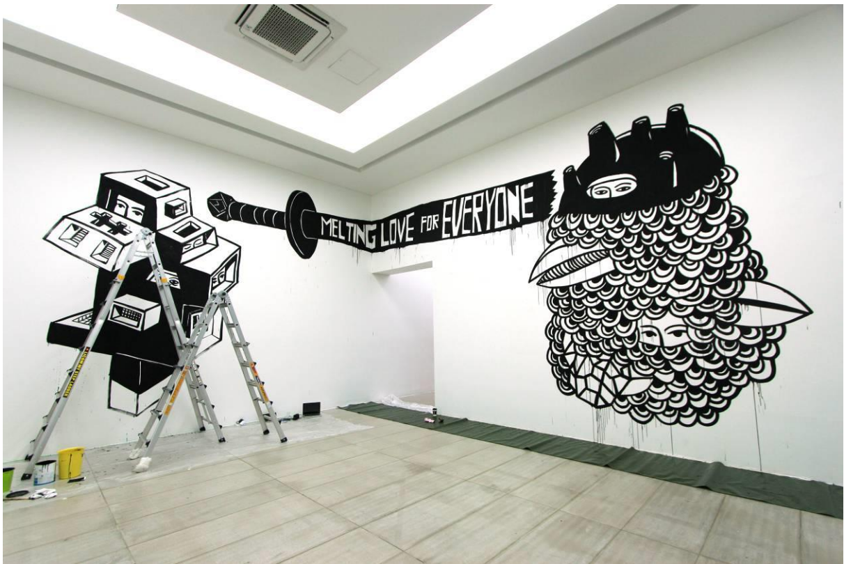
Wall Painting at Arario Gallery, Seoul, Korea