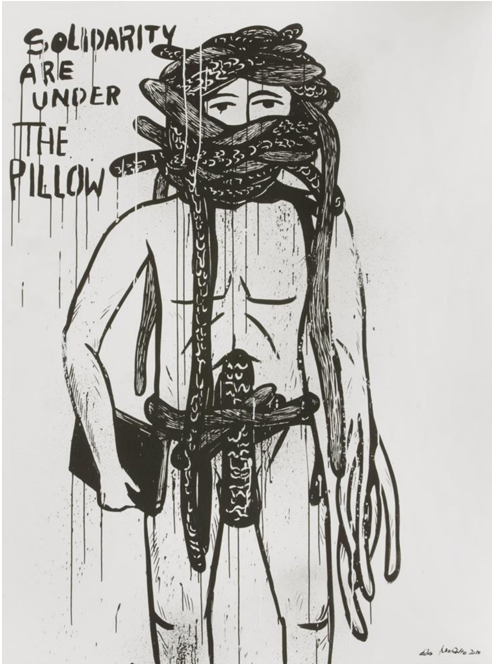
Solidarity are under the pillow

2012, Acrylic, ink, krink marker on canvas, 200x150cm