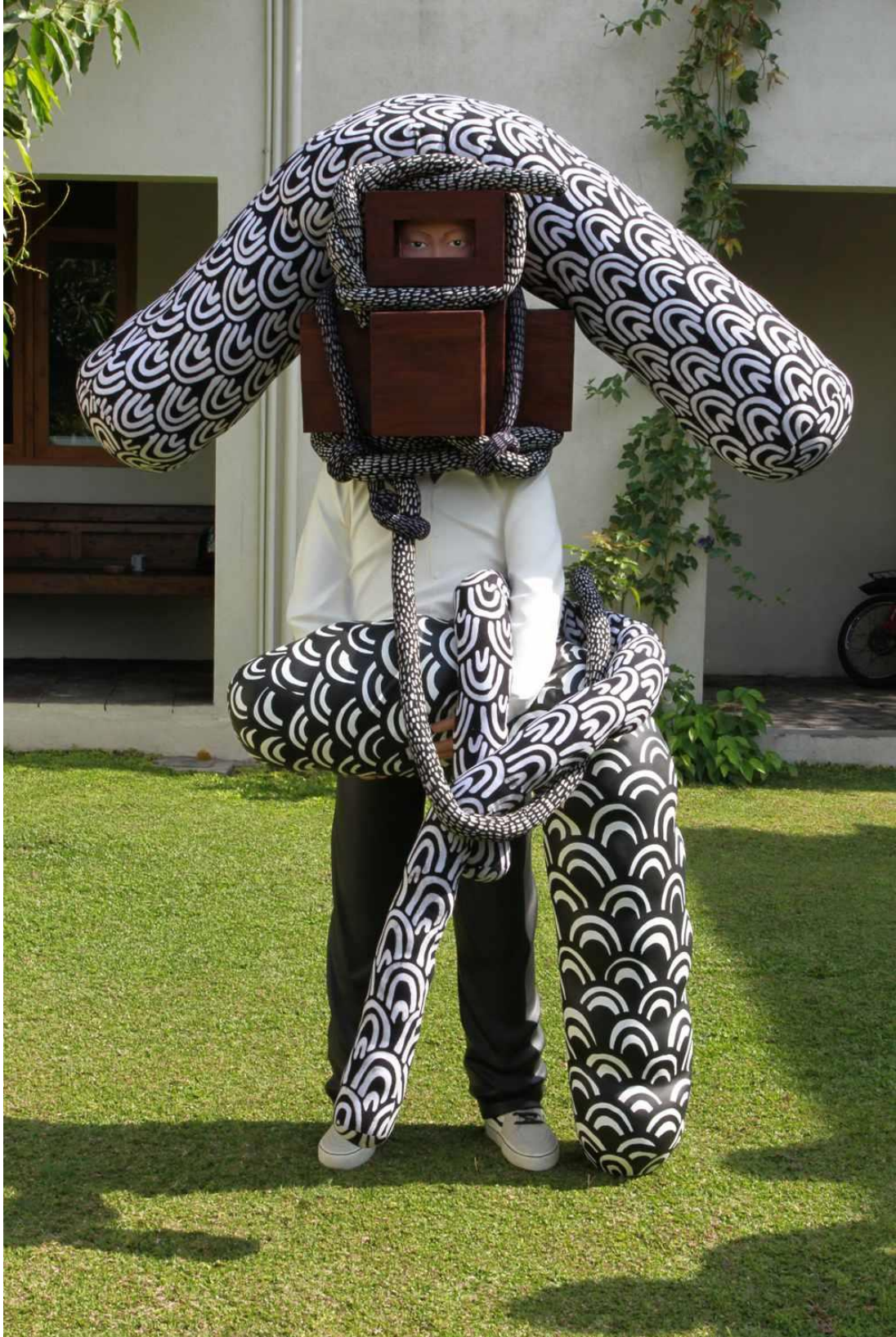
Let Me Thinking Of You, 2012, 혼합재료, 190x90x70cm