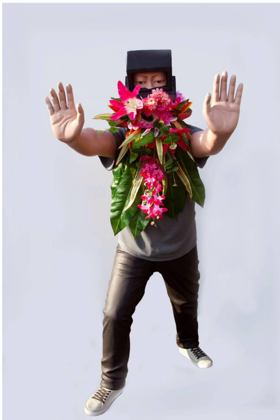
Let Me Believe

2013, fiber resin figure painted with acrylic, plastic flowers, 163x110x86cm (front)