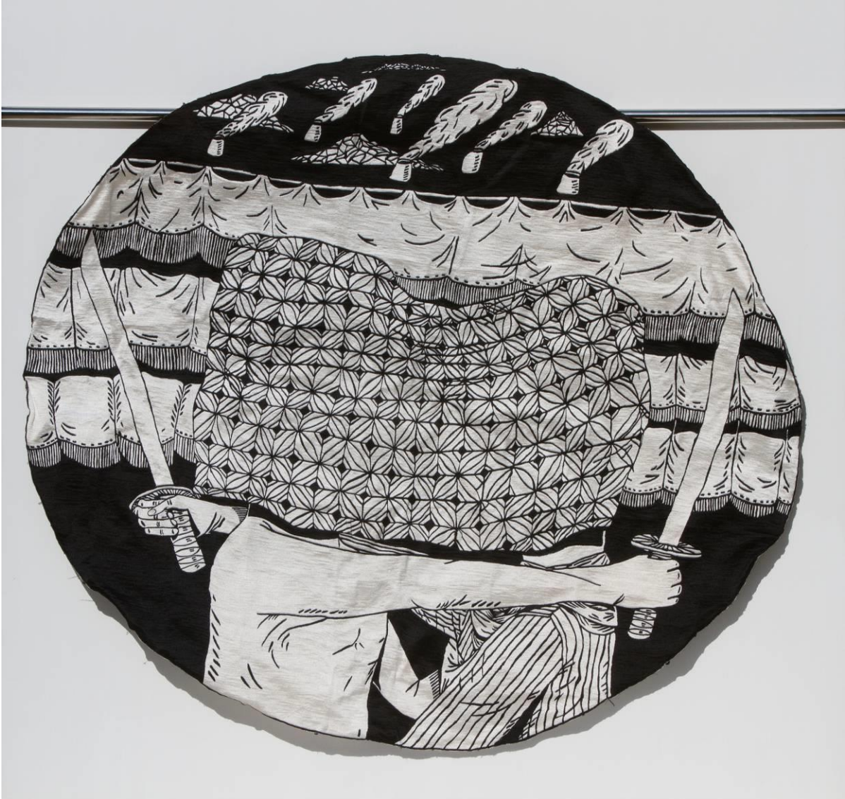
Anomali In Animated, 2013, machine embroidered rayon thread on fabric backing, 139cm diameter