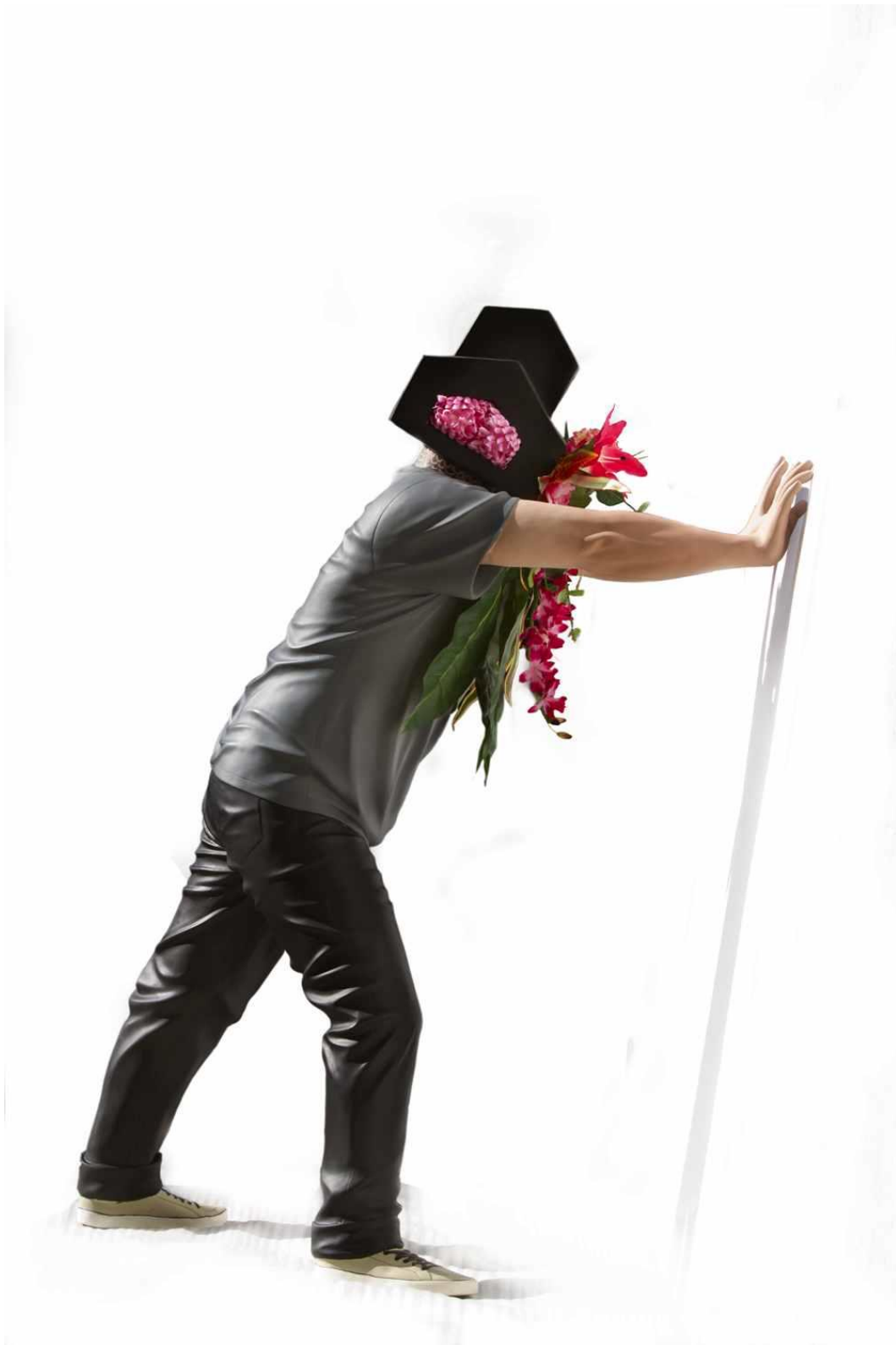
Let Me Believe

2013, fiber resin figure painted with acrylic, plastic flowers, 163x110x86cm (front)