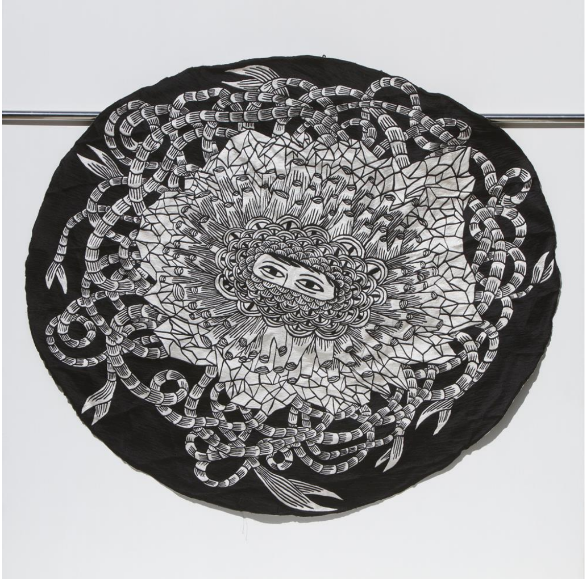
Medusa Generation, 2013, machine embroidered rayon thread on fabric backing, 136cm diameter