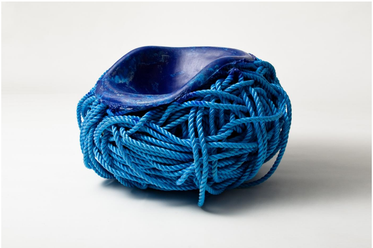
Meltdown Chair: PP Blue Rope, 2007, polypropylene rope, 75 x 95 x 95 cm