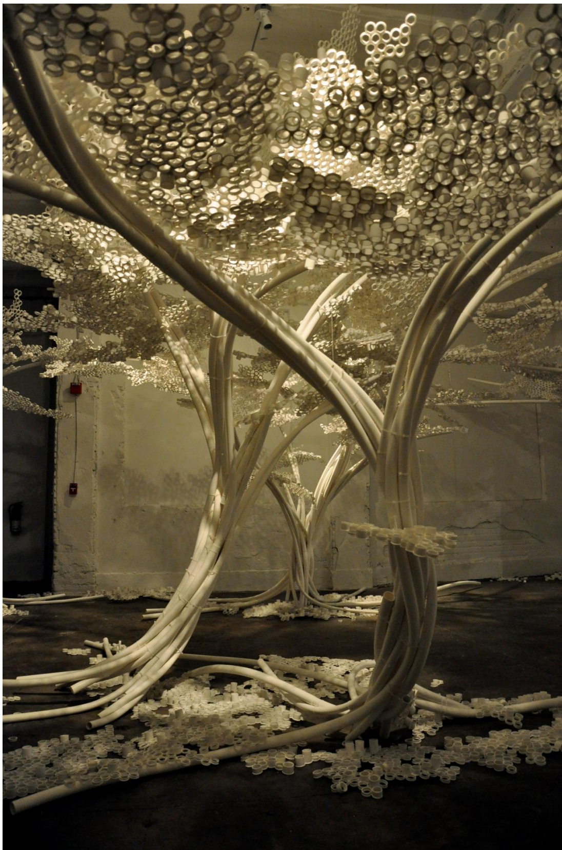
PP Tree, 2011, polypropylene pipe, nylon cable ties, stainless steel wire rope, Tube diameters: 32 mm & 40mm, Tree heights: approx 3 m to 5 m, Tree widths: approx 2 m to 4 m _ Detail