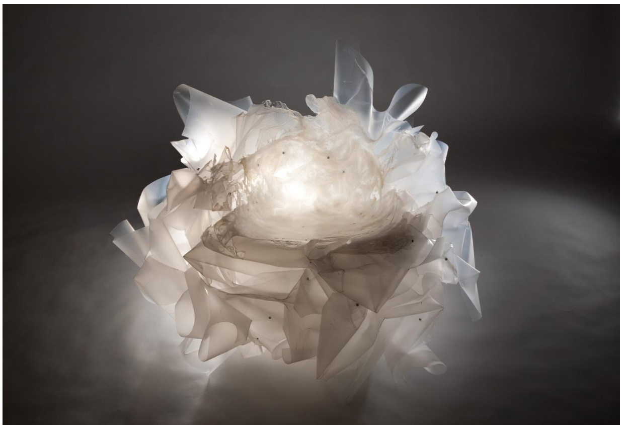
Meltdown Chair: PP Sheet, 2008, polypropylene rope, 110 x 150 x 150 cm