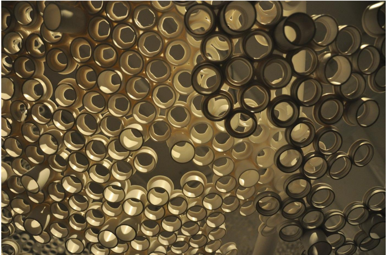
PP Tree, 2011, polypropylene pipe, nylon cable ties, stainless steel wire rope, Tube diameters: 32 mm & 40mm, Tree heights: approx 3 m to 5 m, Tree widths: approx 2 m to 4 m _ Detail