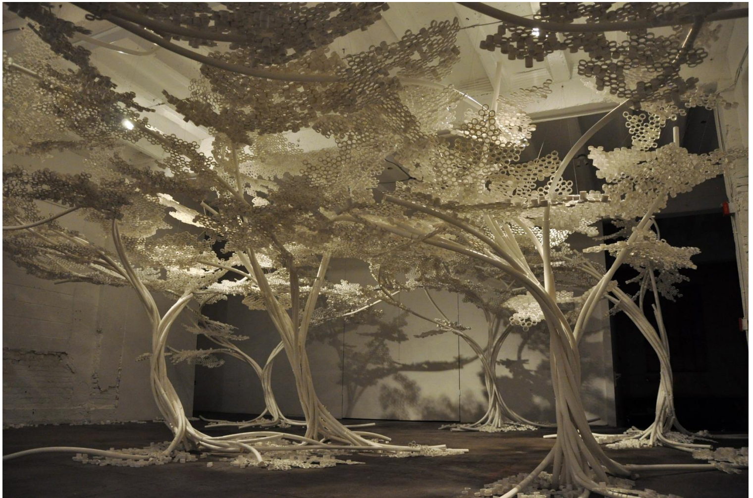
PP Tree, 2011, polypropylene pipe, nylon cable ties, stainless steel wire rope, Tube diameters: 32 mm & 40mm, Tree heights: approx. 3 m to 5 m, Tree widths: approx. 2 m to 4 m