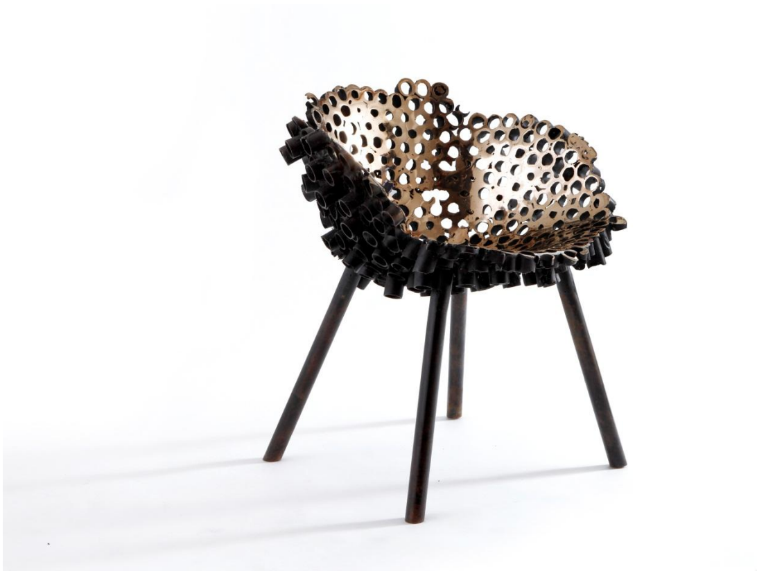
Meltdown Chair: Bronze #1, 2011, Bronze, 75 x 45 x 45 cm