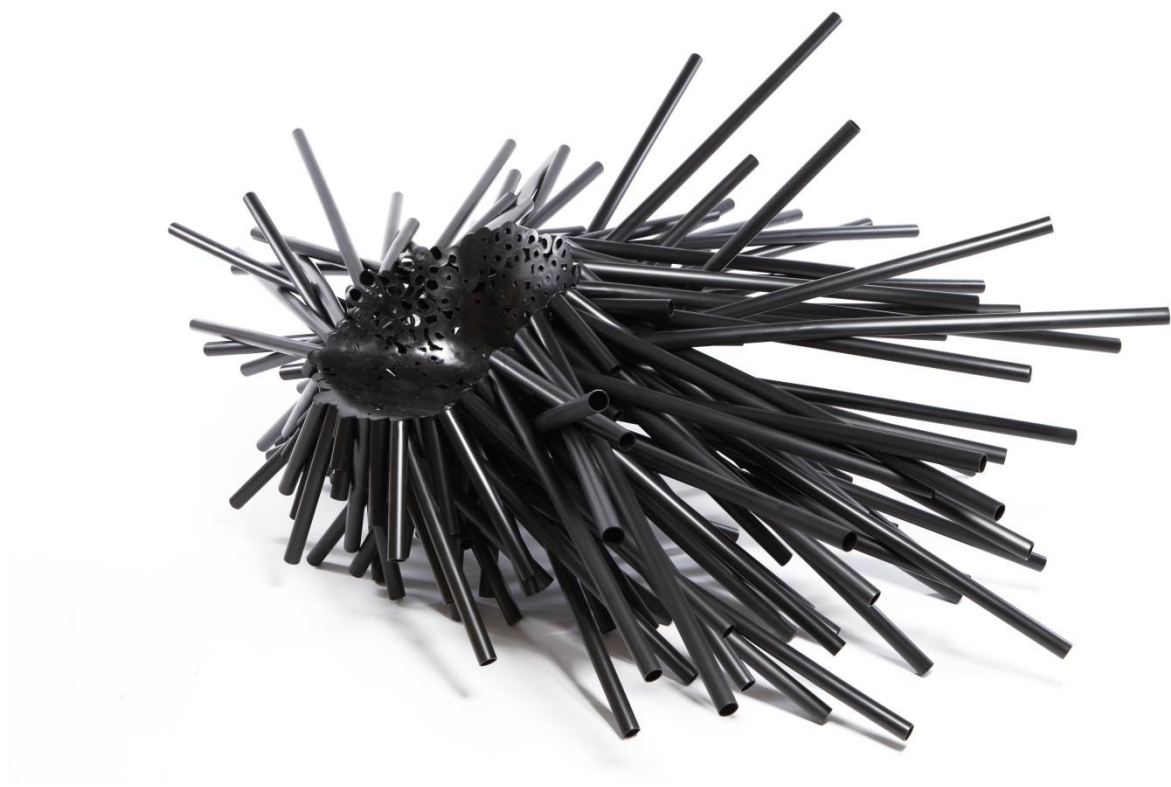
Meltdown Chair: PP Tube #1 Black, 2012, polypropylene tubes, 120 x 180 x 140 cm