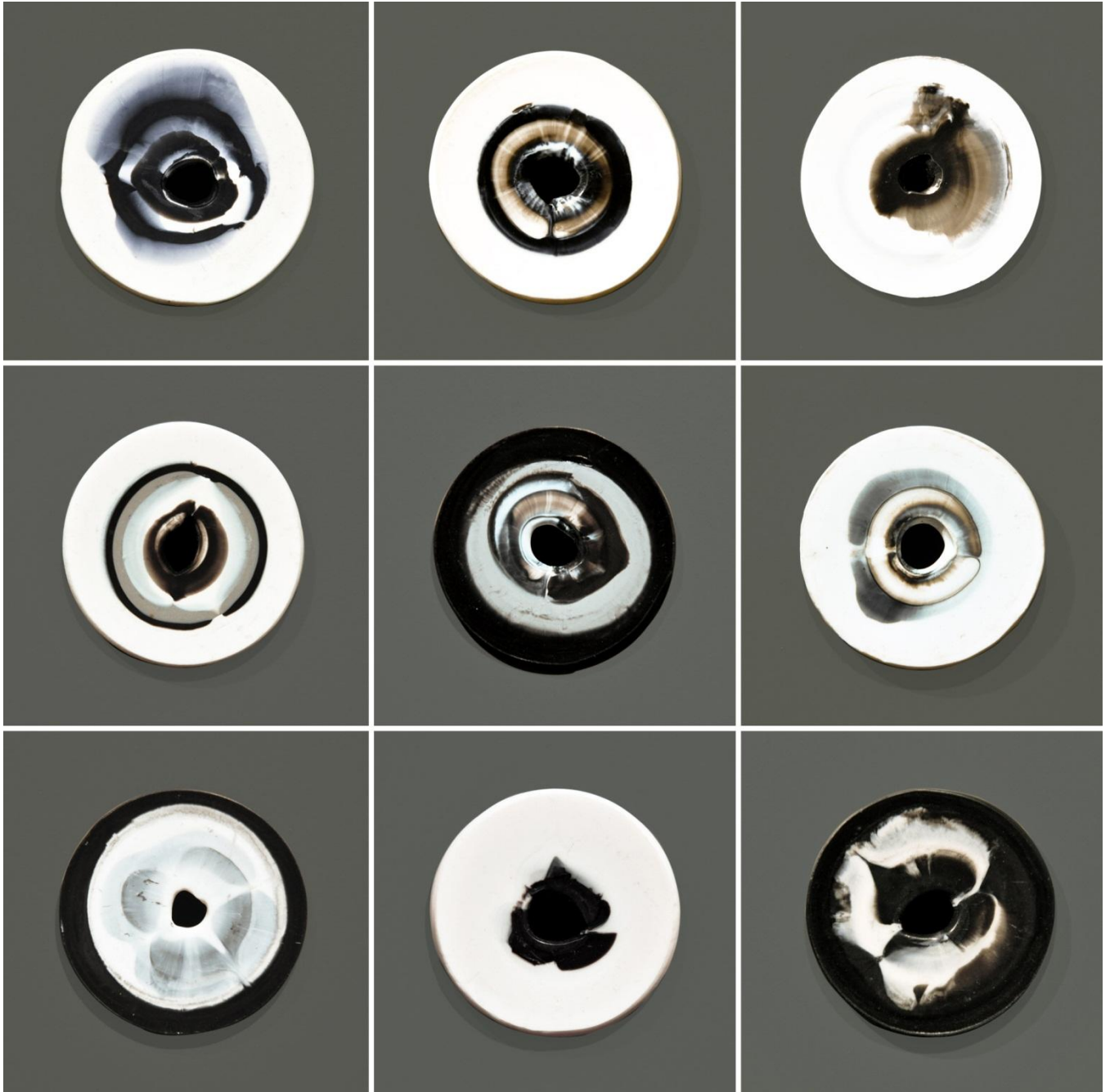
PP EXP #1, 2011, mixed media on canvas, 120 x 360 x 10cm_Detail