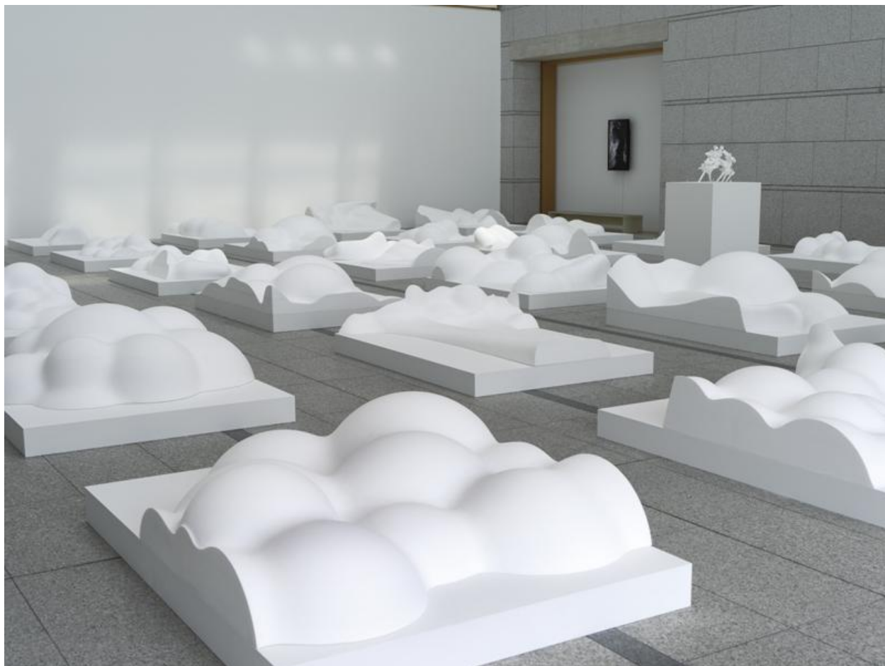
Manifold_Model, 2011, mixed media, 43.9x52.5x41.3cm