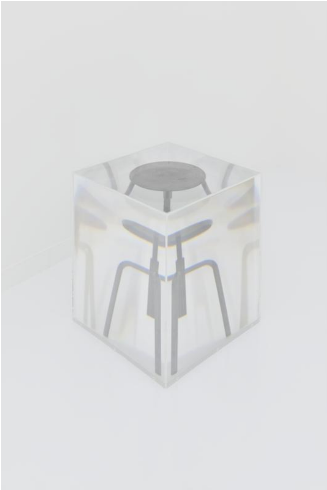
PixCell[Stool], 2011, mixed media, 64.6x51.3x51.3cm