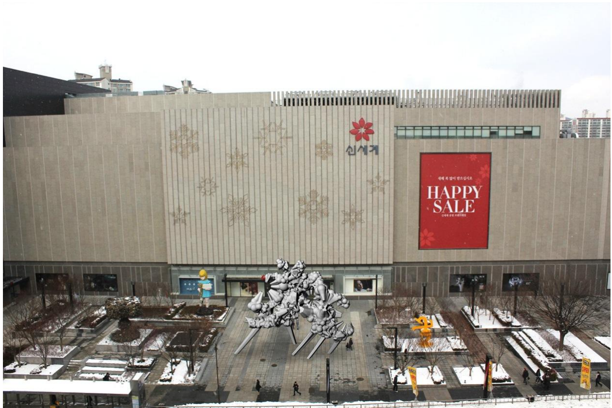
Manifold_Model, 2011, mixed media, Virtual Installation View at ARARIO Sculpture Garden, Cheonan