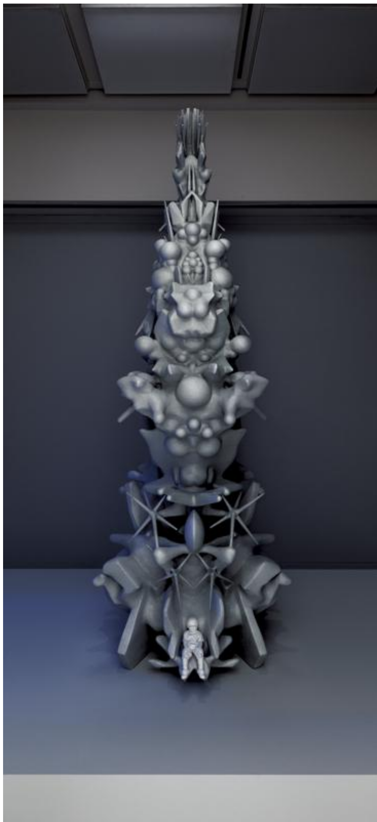
Throne, 2011, mixed media, 300x90.5x145.3cm