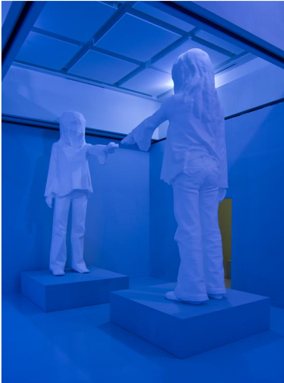
Polygon- Double Rio A, 2011, mixed media, 370x110x189cm