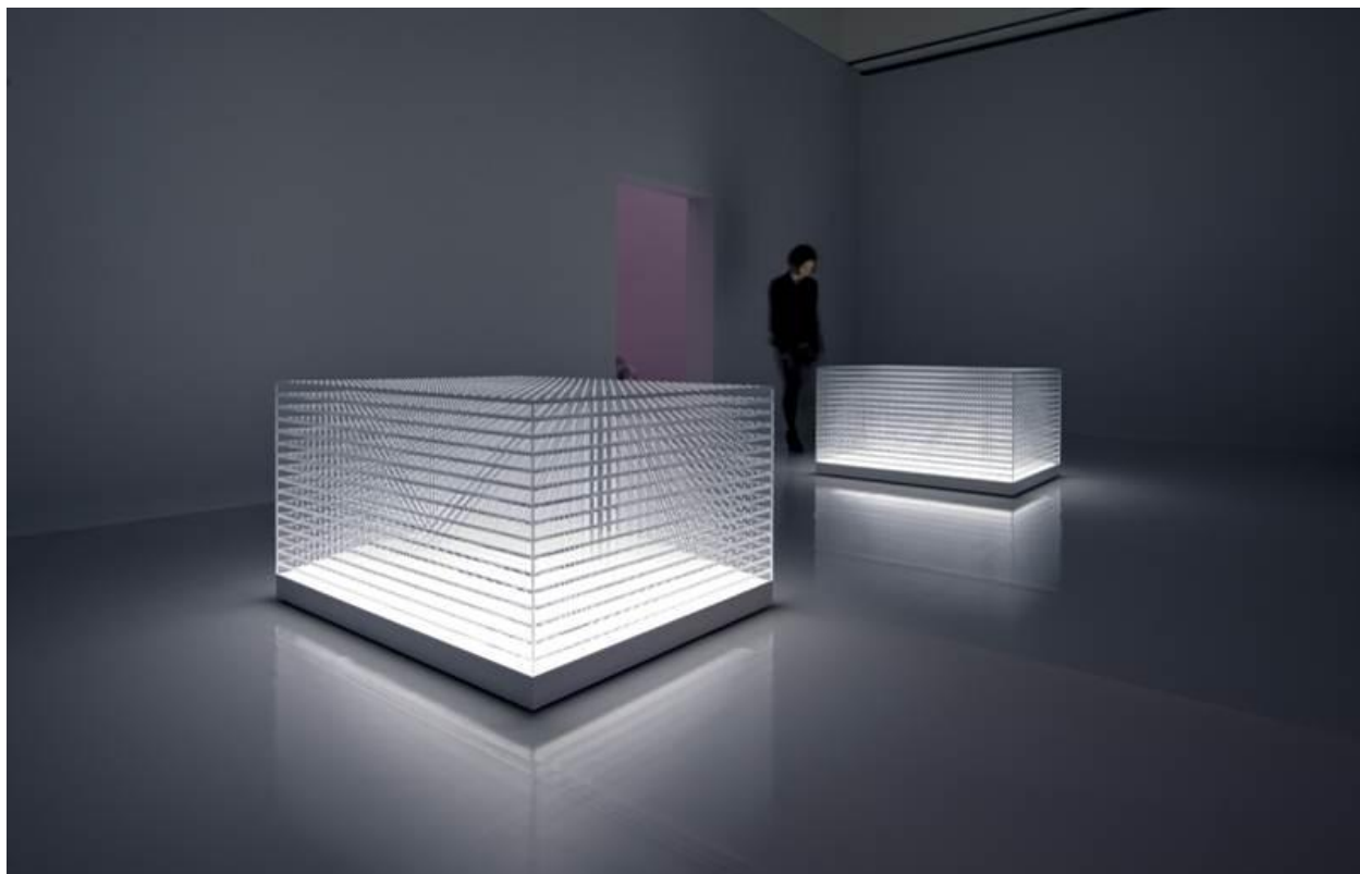
AirCell_A_37mmp, 2011, mixed media, 112.1x96.2x59.2cm_photo by Seiji Toyonaga (SANDWICH GRAPHIC)