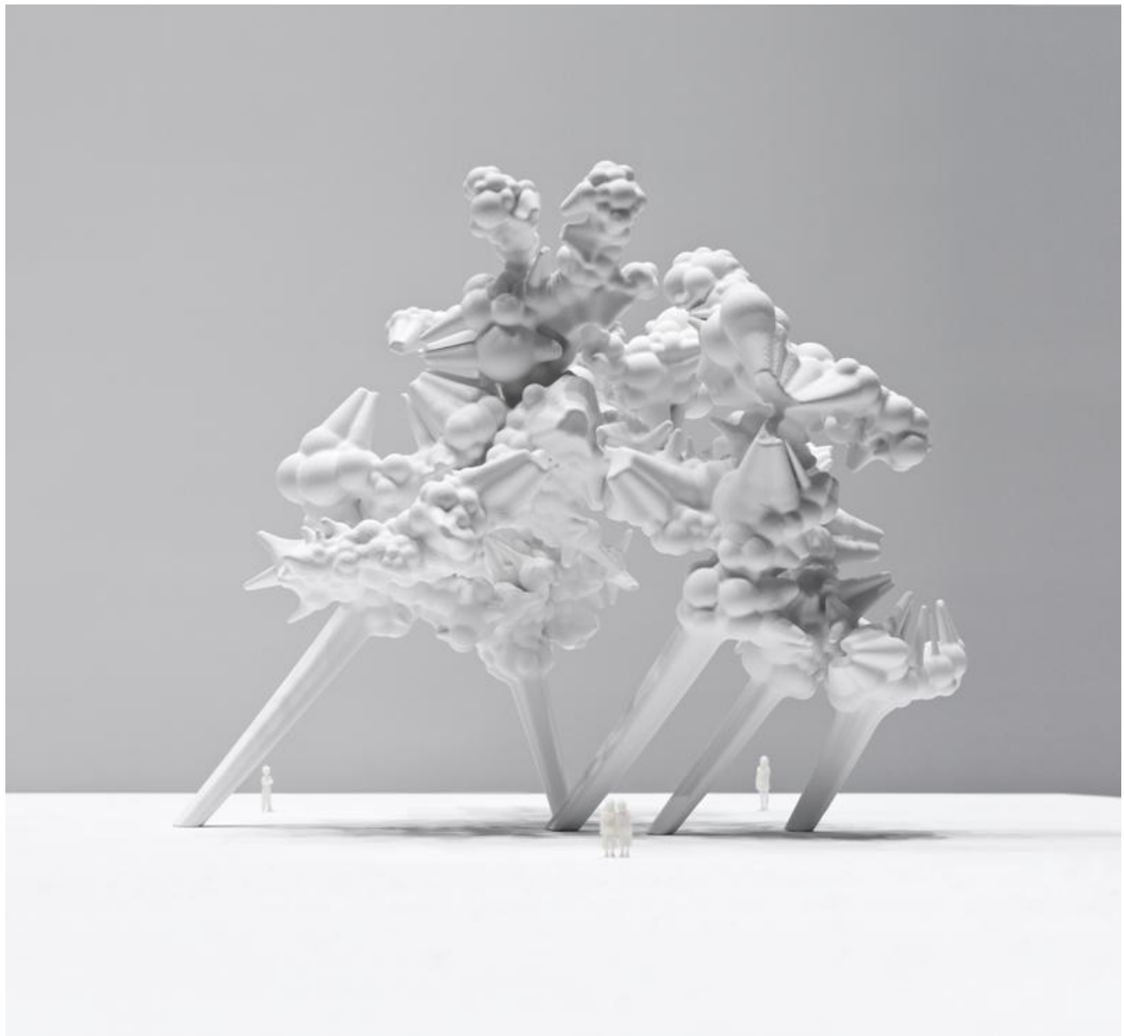
Manifold_Model, 2011, mixed media, 43.9x52.5x41.3cm