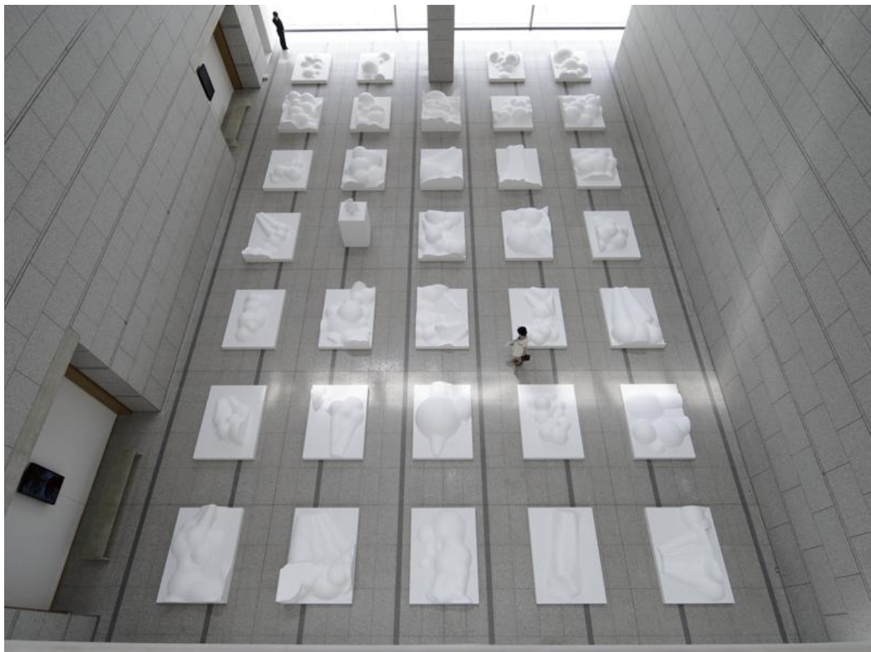
Manifold_Model, 2011, mixed media, 43.9x52.5x41.3cm