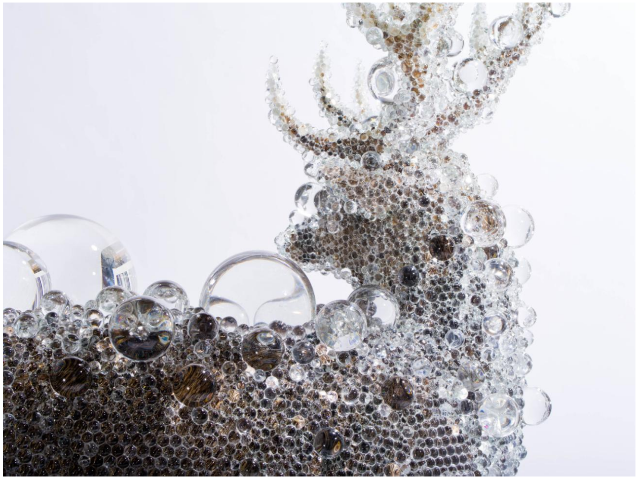
PixCell-Double_Deer#6, 2012, mixed media, 229.7x190x160cm