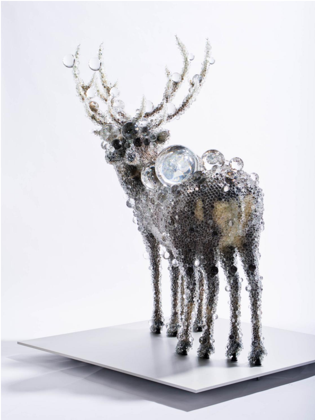
PixCell-Double_Deer#6, 2012, mixed media, 229.7x190x160cm