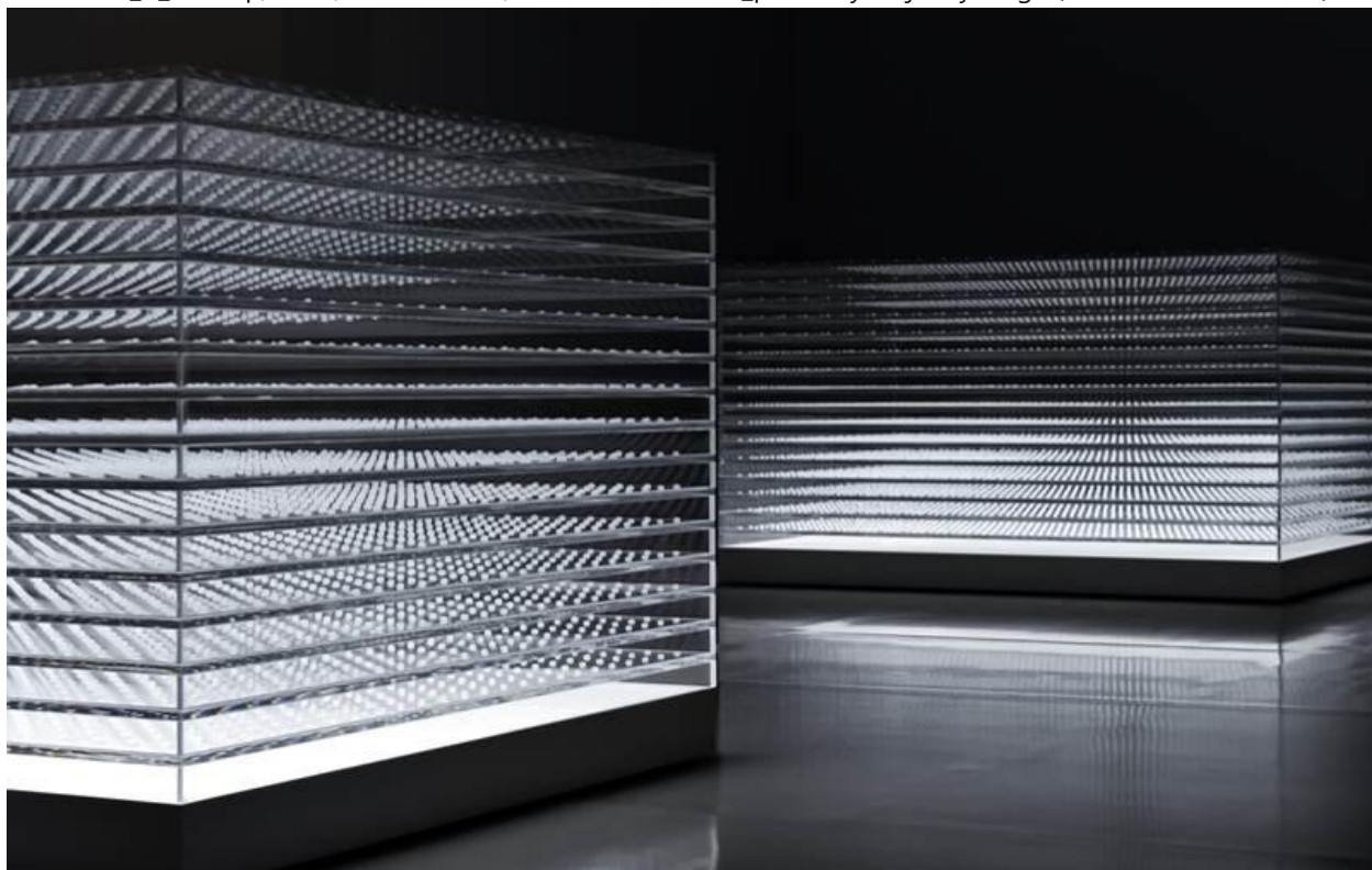
AirCell_A_37mmp, 2011, mixed media, 112.1x96.2x59.2cm