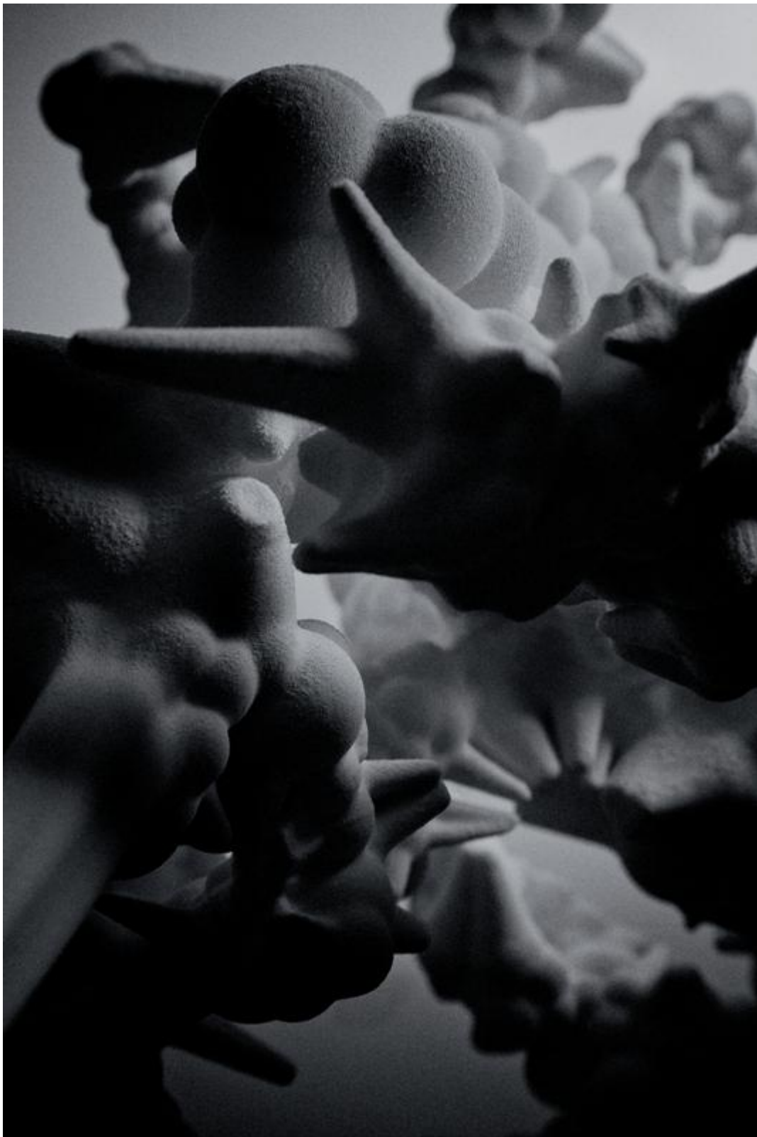
Manifold_Model, 2011, mixed media, 43.9x52.5x41.3cm