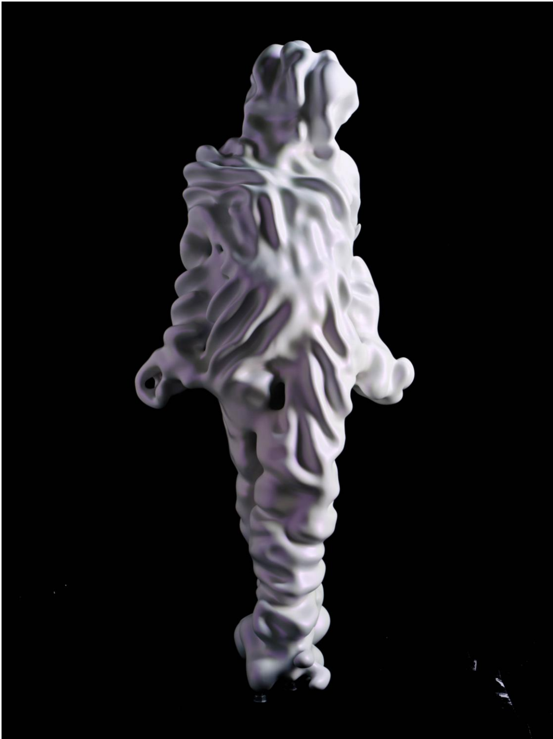
Stroke-Yana, 2012, mixed media, 195.8×66.2×72.6cm