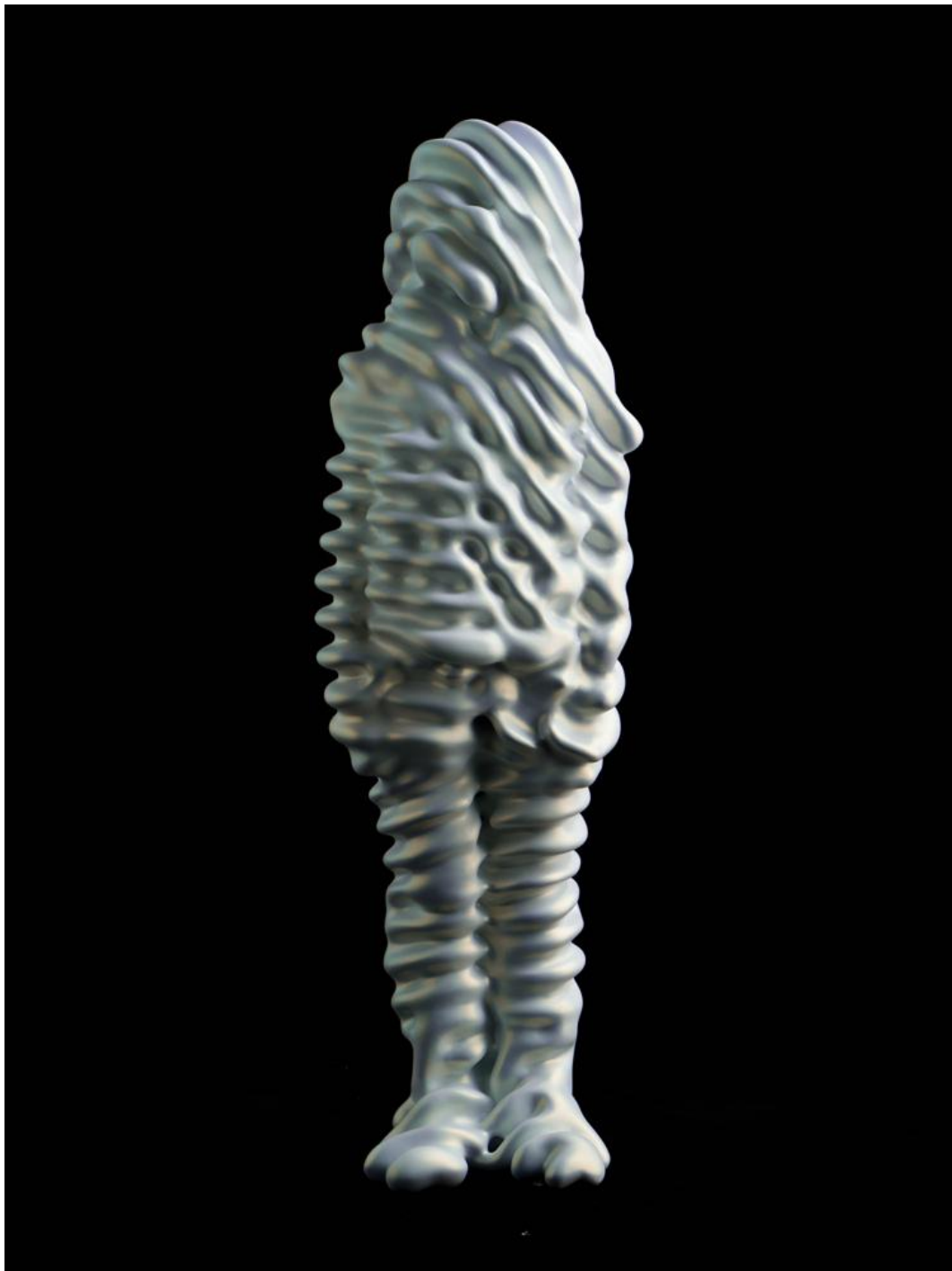
Stroke-Rio, 2012, mixed media, 98.6x30.9x24.5cm