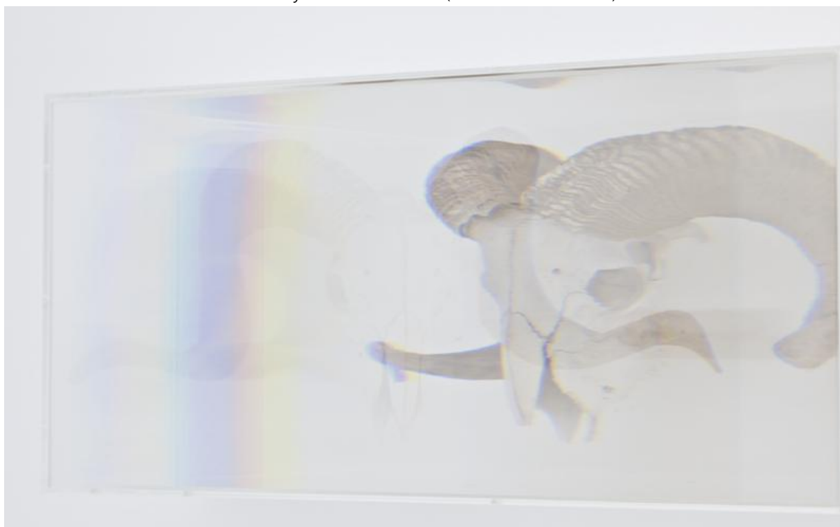
PixCell[Ram skull], 2011, mixed media, 29.1x81.3x39.3cm, detail