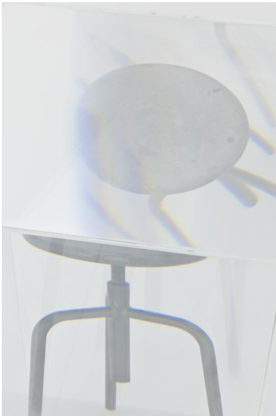
PixCell[Stool], 2011, mixed media, 64.6x51.3x51.3cm, detail