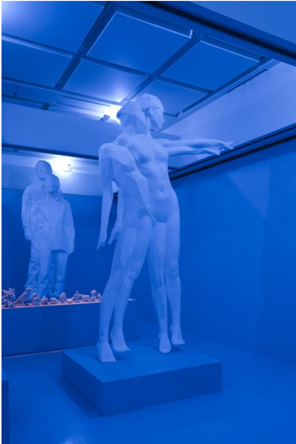
Polygon- Double Yana, 2010, mixed media, 400x270x69cm