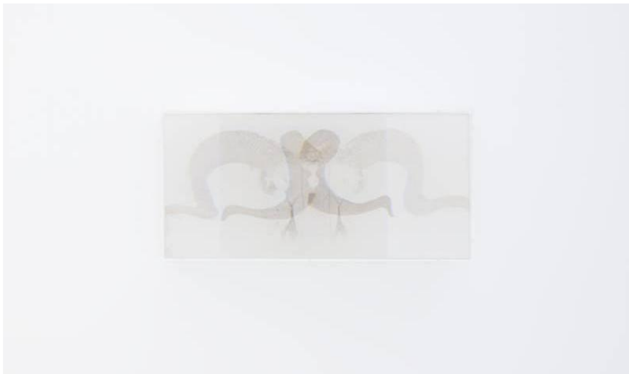
PixCell[Ram skull], 2011, mixed media, 29.1x81.3x39.3cm