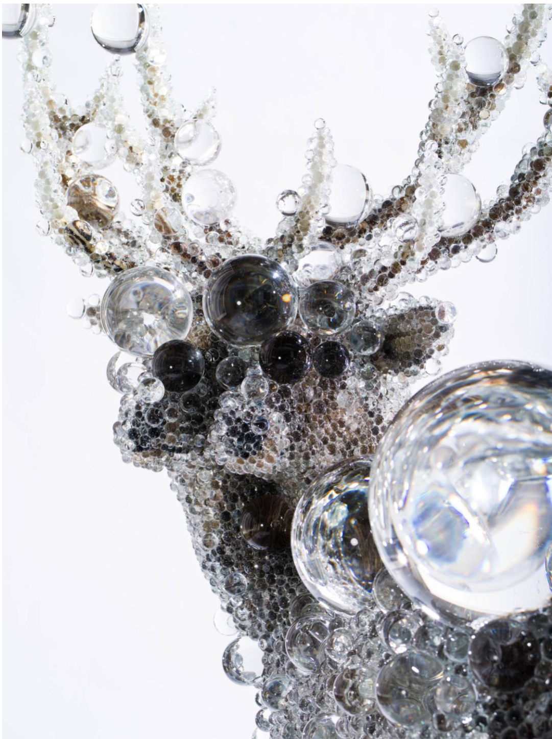
PixCell-Double_Deer#6, 2012, mixed media, 229.7x190x160cm