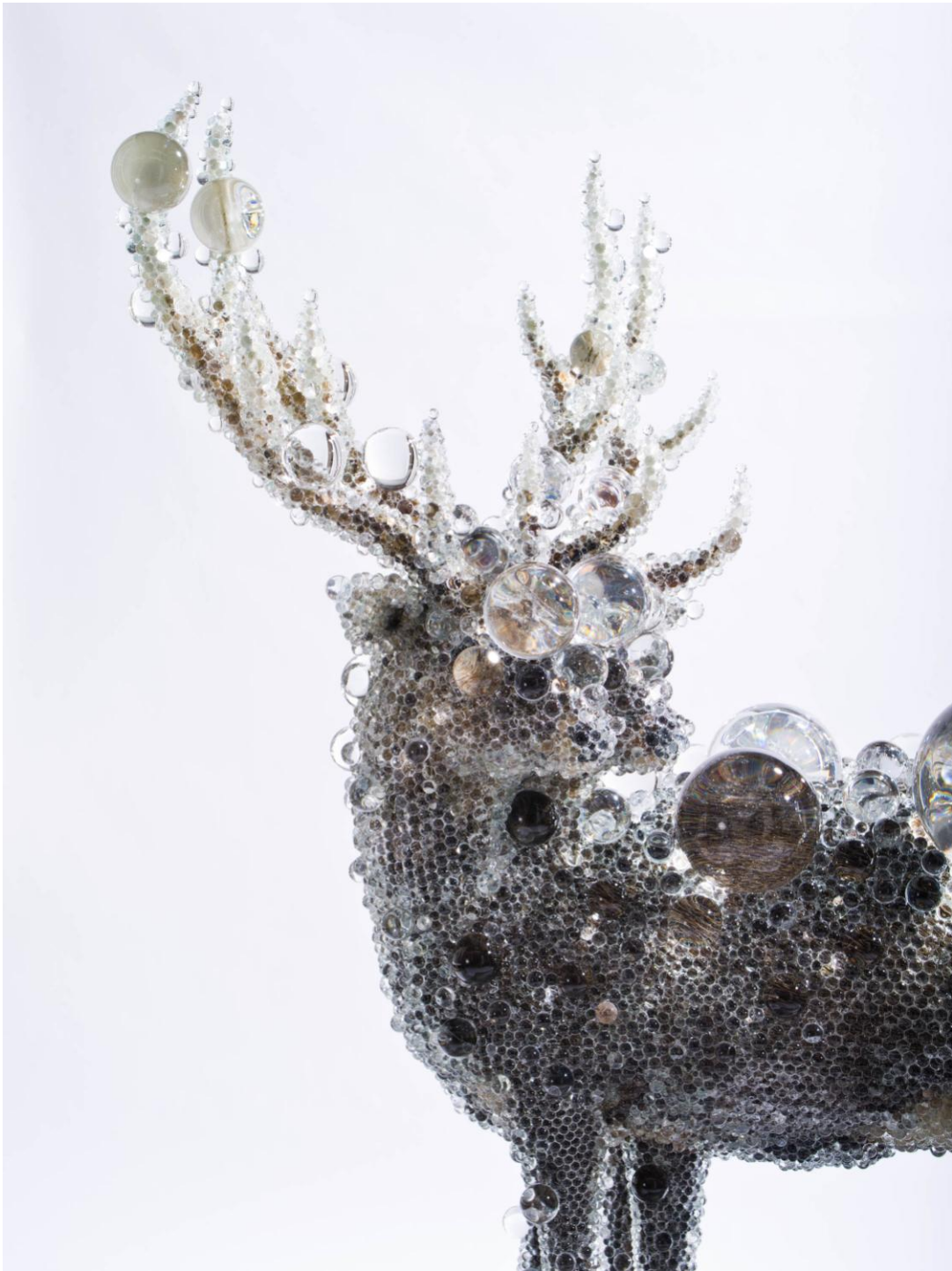
PixCell-Double_Deer#6, 2012, mixed media, 229.7x190x160cm