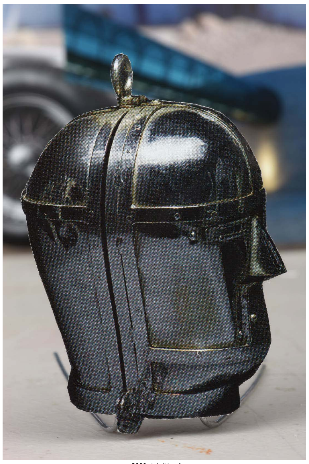
2009, July(Head) 2011_lightjet print, wood frame_154x105cm