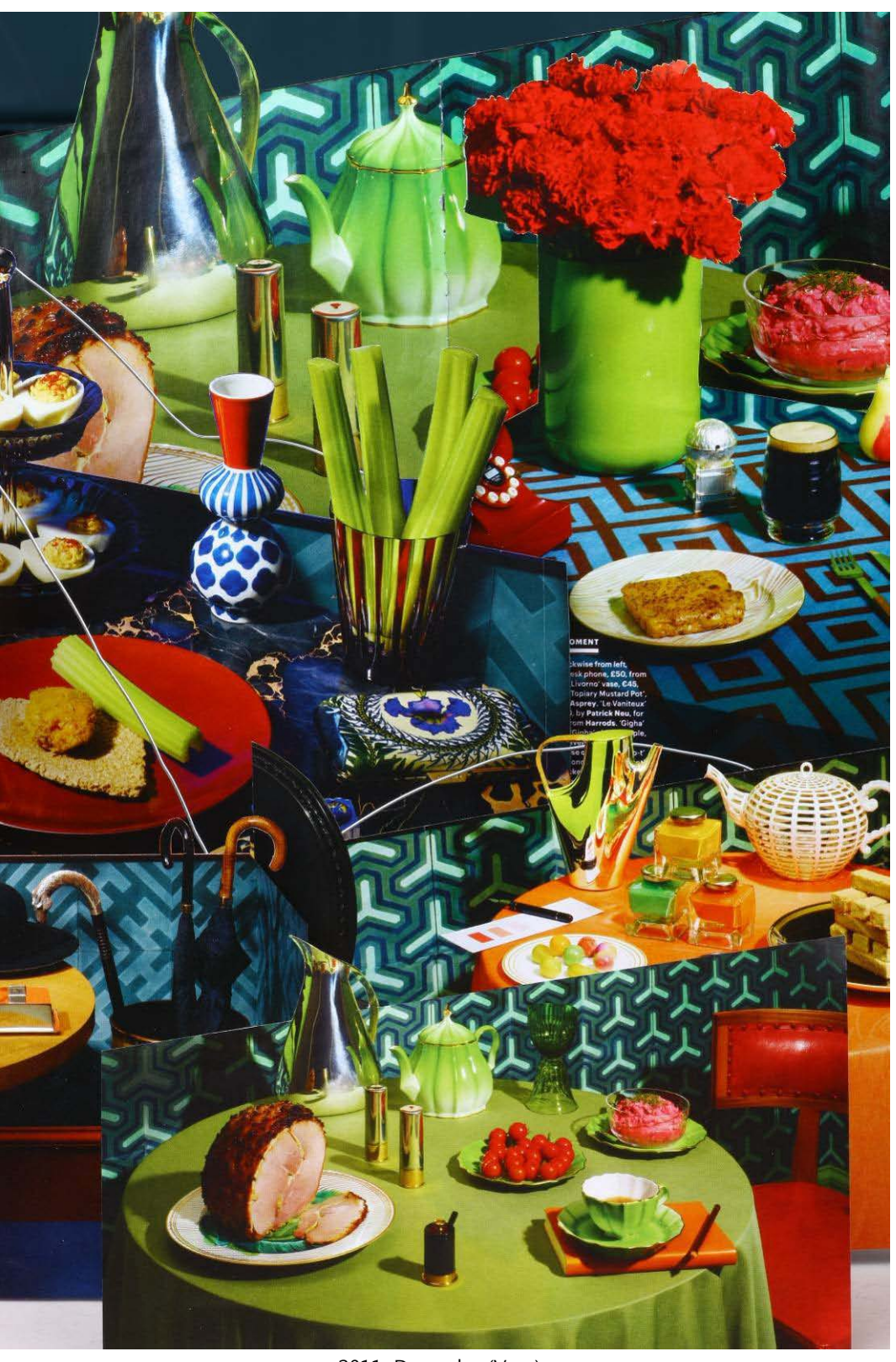
2011, December(Vase) 2011_lightjet print, wood frame_154x105cm