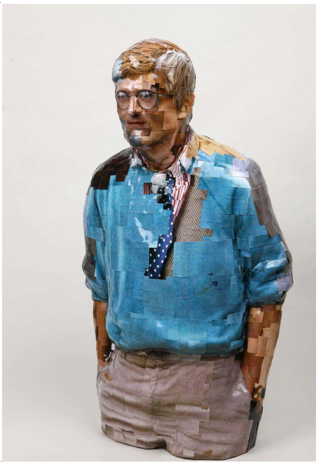
Untitled 2012_c-print, mixed media_118x70x47cm