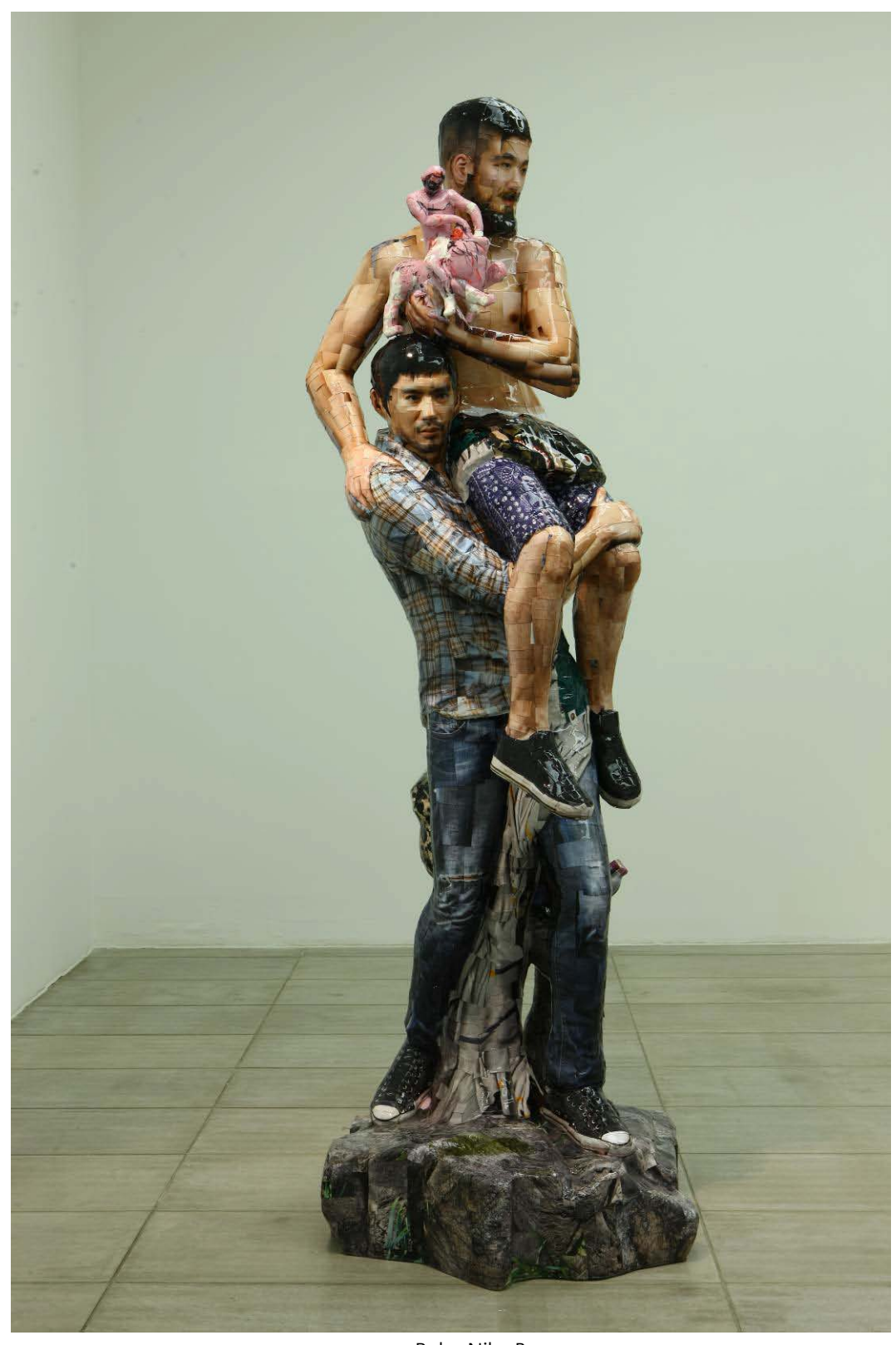
Ruby Nike Bape 2012_c-print, mixed media_ 265x118x106.5cm