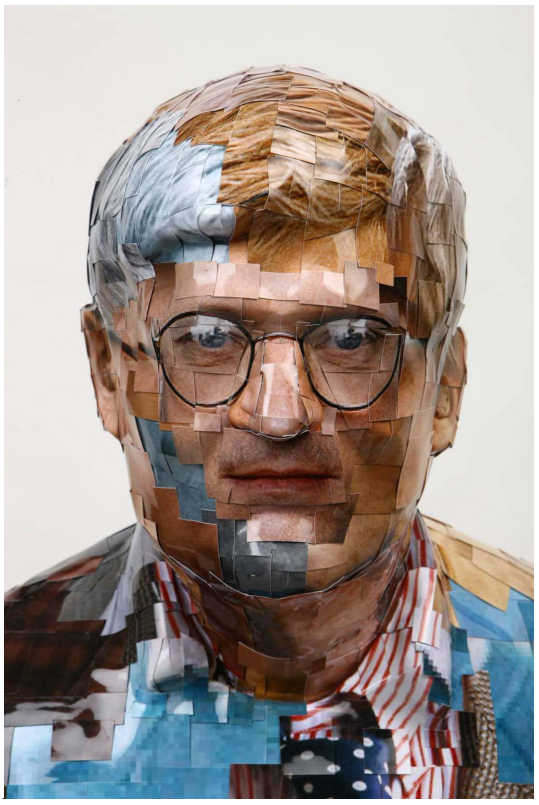
Untitled 2012_c-print, mixed media_118x70x47cm_detail