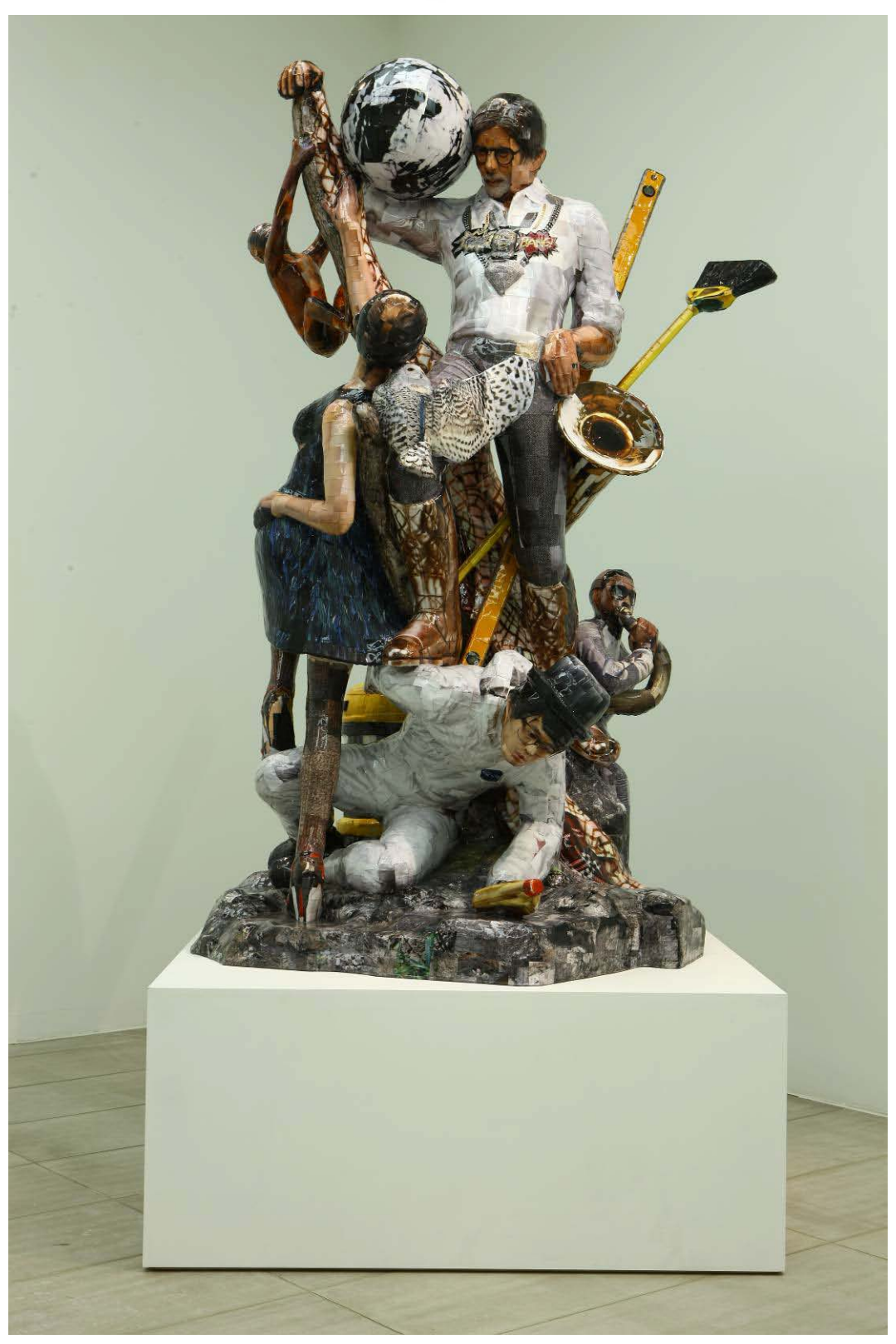
Untitled 2012_c-print, mixed media_ 265x142x141cm