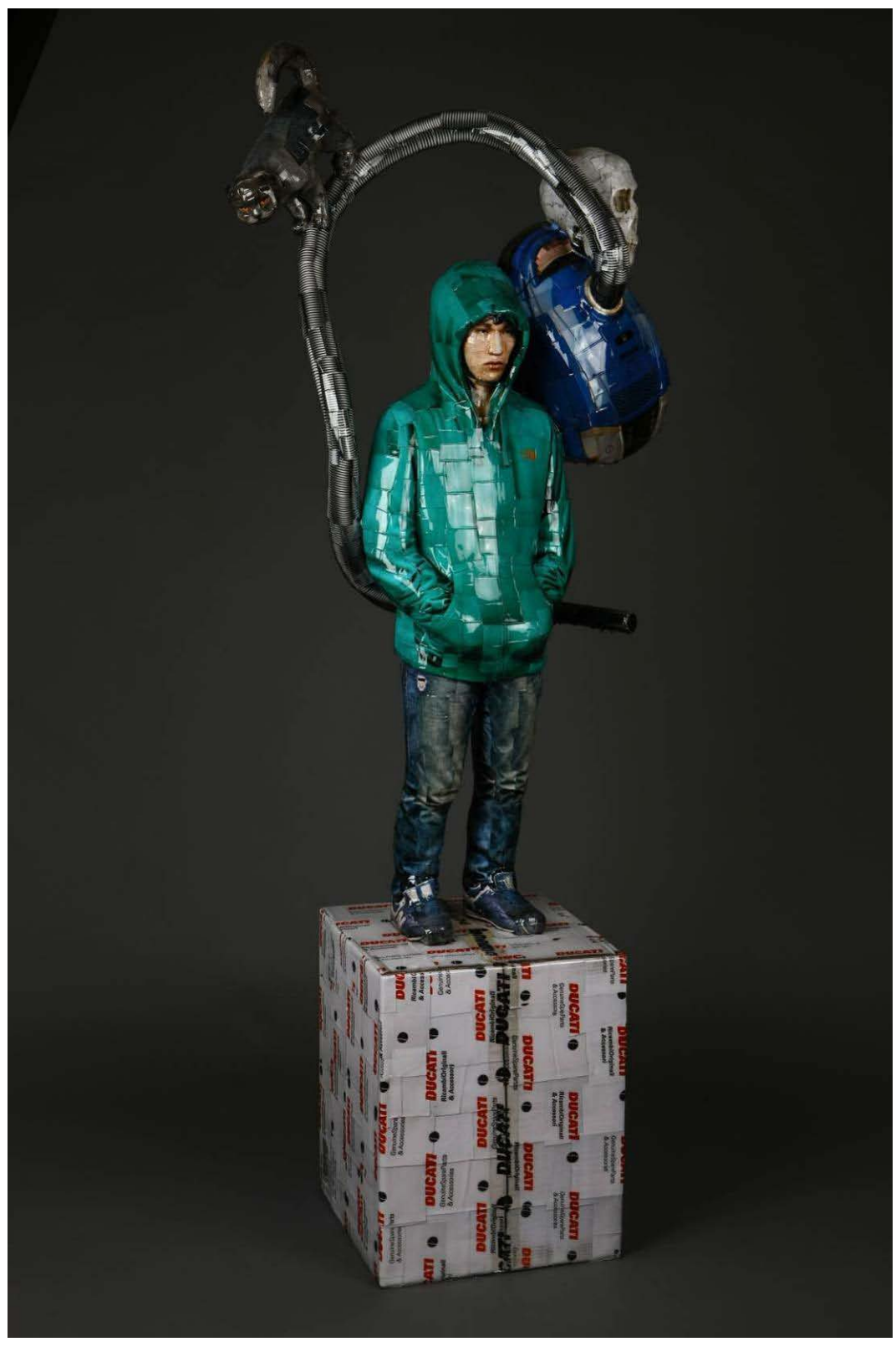
Khumbu & Kuma 2012_c-print, mixed media_210x95x50cm