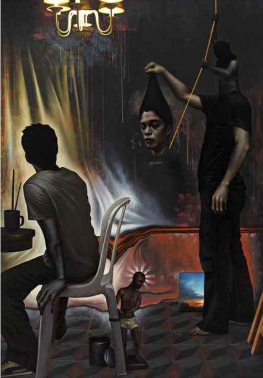
Leslie de Chavez_Through the Looking Glass_2011 Oil on canvas 200x140cm