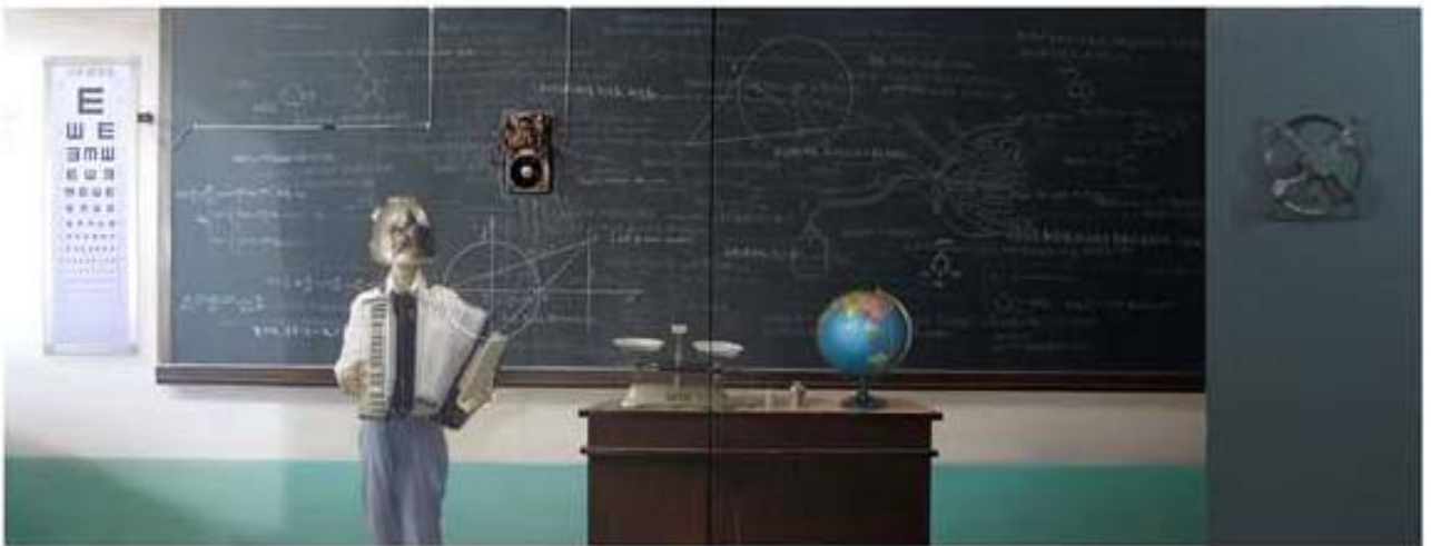
Yan Heng _Geometry 5 - Compulsory Education_2011_Oil on canvas_ Painting Installation_150 x 400 cm