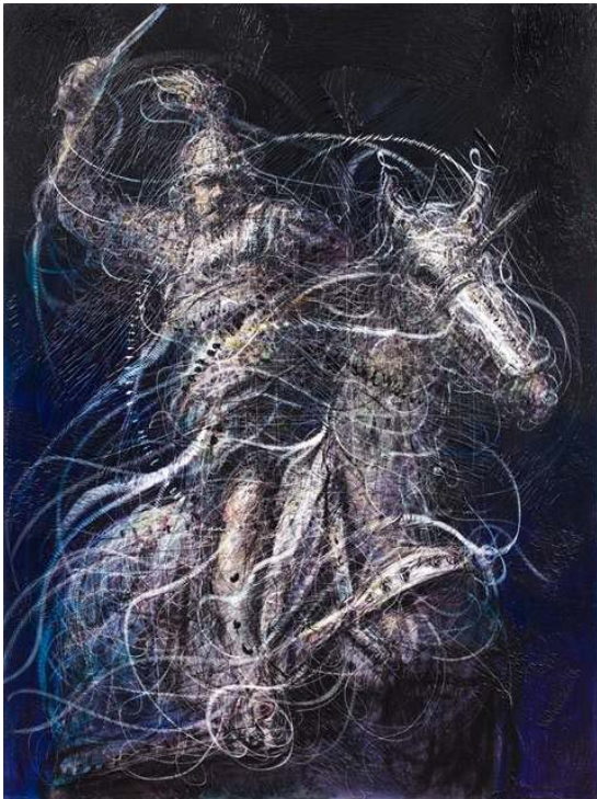
Young Geun Park_An Amor and Helmet_Oil on canvas, 259 x 194 cm, 2009