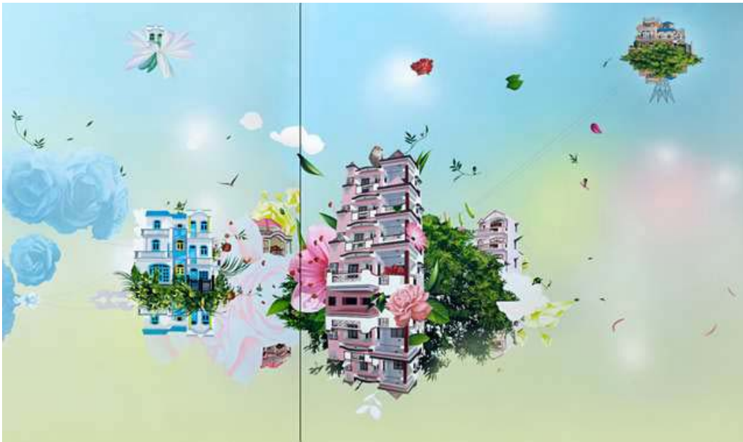
Thukral & Tagra_Dominus Aeries - Grand Mirage 1_2009_oil and acrylic on canvas_183 x 305cm