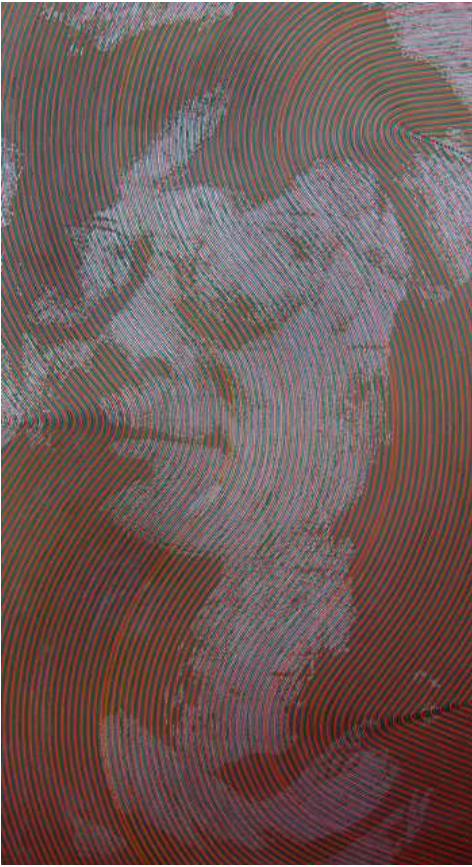
Insane Park_Image- unknown_2011_Cable wire on wooden panel_68x121cm