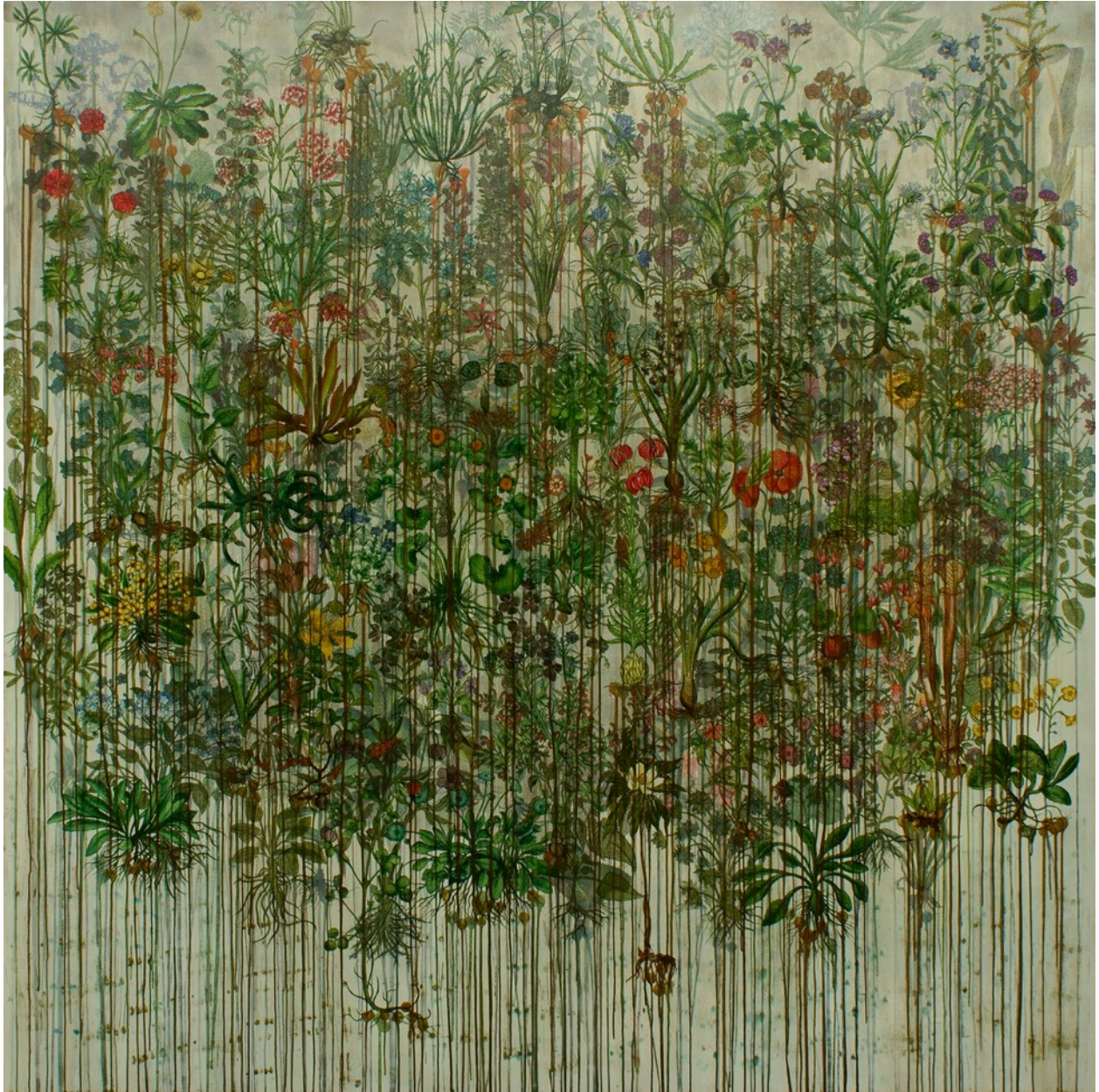
Geraldine Javier | To The Gardeners of Kabul | Fluid Acrylics, Liquid Graphite on Canvas | 243 x 243 cm | 2017