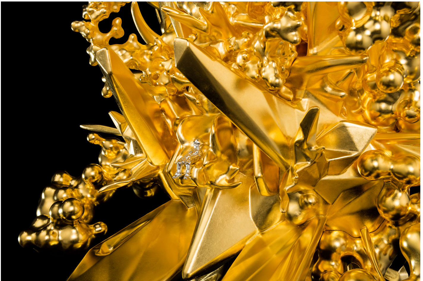
Kohei Nawa | Throne (g/p_boy) (detail), Mixed Media, 140 x 73.6 x 59 cm, 2017, Photo: Nobutada Omote | SANDWICH © Kohei Nawa | ARARIO GALLERY

By combining 20 sculptural figures on a 24-meter long stage with the special designed sound effect, VESSEL will be displayed in the individual space of Arario Gallery Shanghai as a highlight of the exhibition. Three years before, the homonymic performance work was screened through Kohei Nawa's first solo exhibition in Arario Gallery Shanghai, the concept of life and death, or, the idea of "liquefying" and "dissolving" was represented by the distinctive "headless" pose and melded bodies and left a memorable experience to audiences. As a continuation, VESSEL installation extracts sculptural performing physiques and transforms them into a sculpture group concealing gender and identity. It blends various fascinating moments and represents into a collective installation, as well as, converts the figurative bodies into abstract shapes and encompasses with sounds. Consequently, VESSEL installation provides another form of visualization, retaining the experimental fusion but unfold a panoramic view to spectators. The special material of silicon carbide powder is spread on the sculpture's surface as well as on the large-scale stage, transcending genres of art forms. Ultimately, the installation widens the visual experience, which goes beyond dynamic motions and static states.