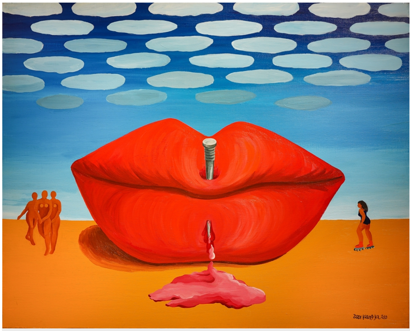
Jung Kang-ja's "Title Unknown" (2001) / Courtesy of the artist, Arario Gallery