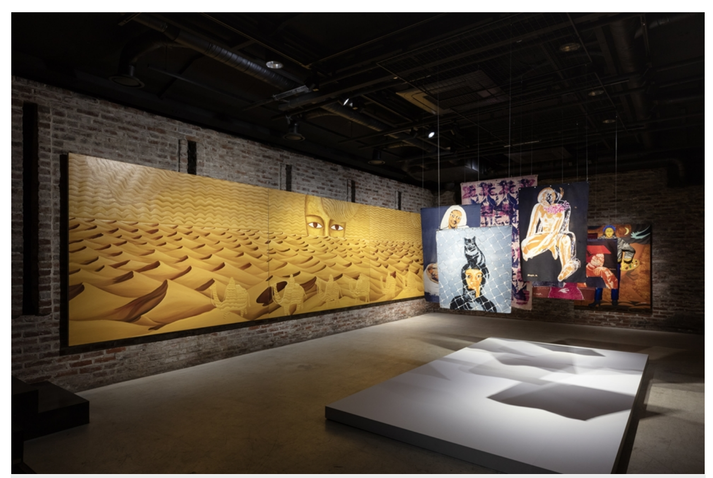
Installation view of Jung Kang-ja's solo exhibition, "Dear Dream, Fantasy and Challenge," at Arario Museum in Space

The Korea Times. "She eventually found marriage as sort of an escape."